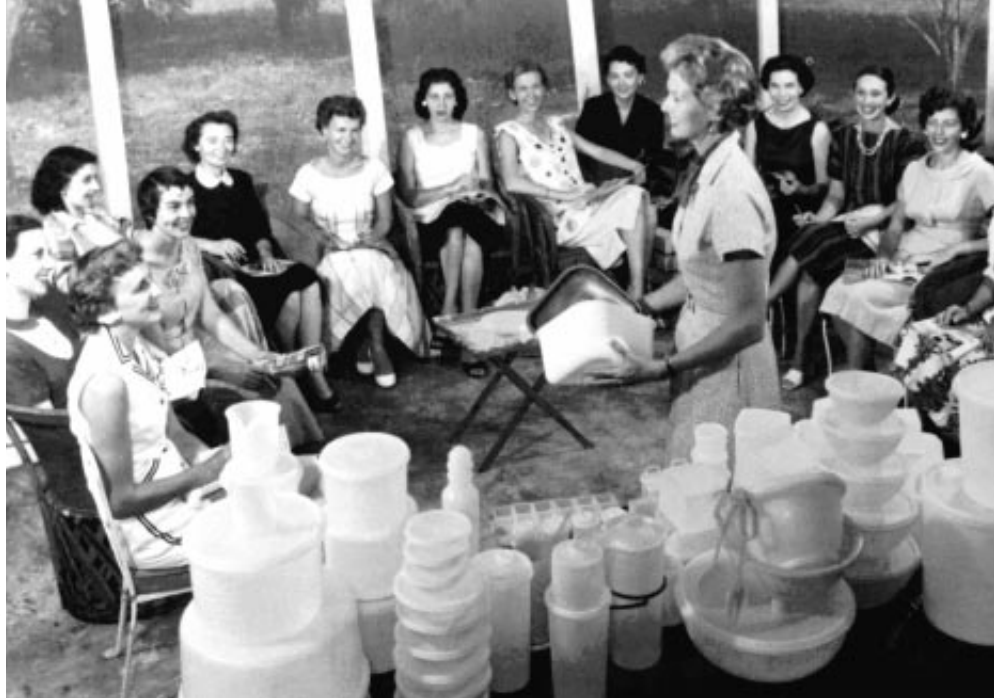
TUPPERWARE (1968)

Copyright 2001 Scientific American, Inc.